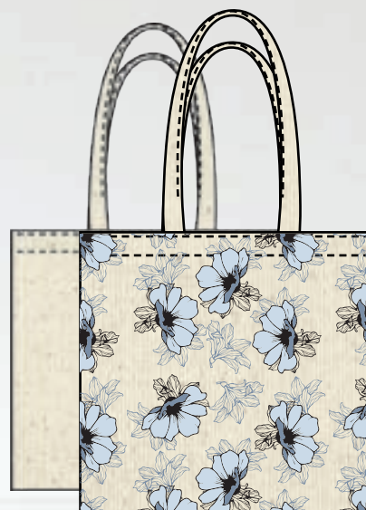
ANNA M- 01