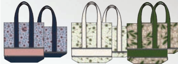
3 PRINTS GODDESS EXTENDABLE MEDIUM TOTE