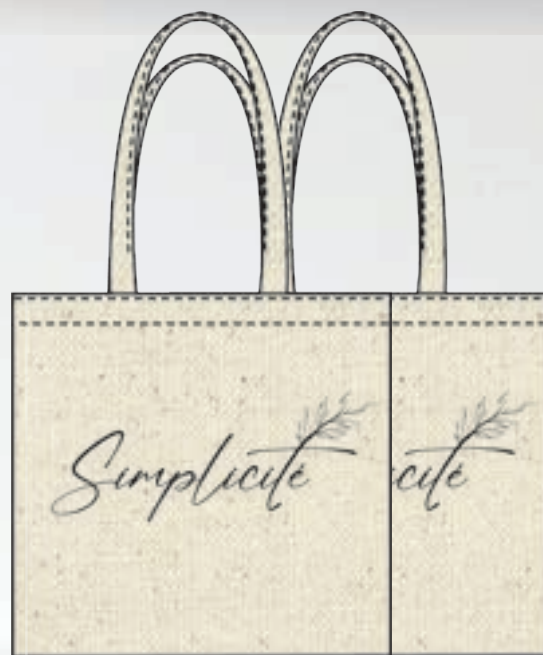
ANNA B- 01