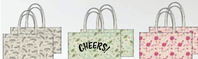
3 PRINTS JULIA 6 BOTTLE / CAN BEER BAG