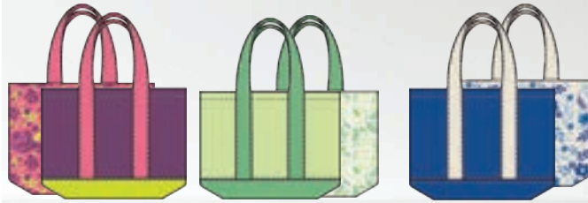
3 PRINTS KATY DOUBLE SIDED MEDIUM TOTE