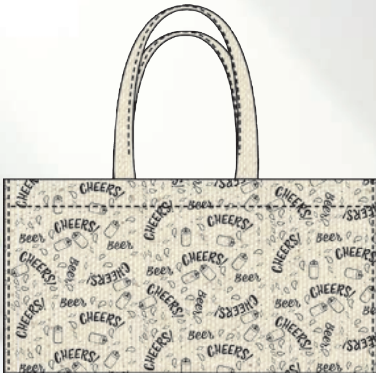
FRONT AND BACK SAME PRINT SIDE PLAIN

COTTON WEBBING HANDLES CLEAN FINISHED INSIDE ENFORCED HANDLES