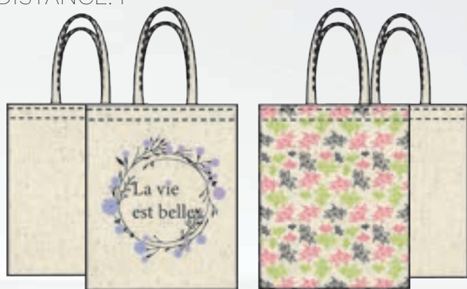
ANNA S- 01