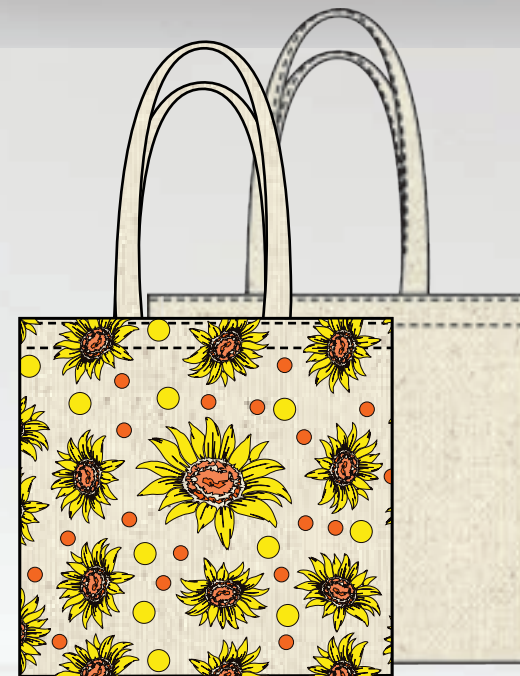
ANNA B- 02