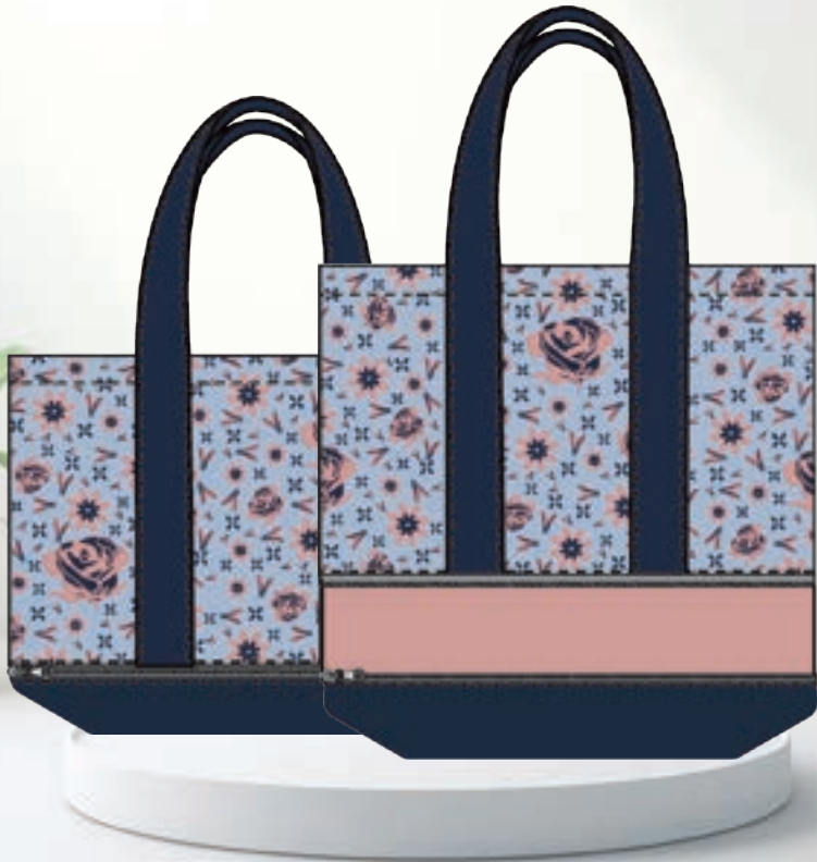
FRONT VIEW - EXTENTION CLOSED